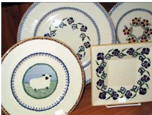
Nicholas Mosse Pottery

The Dennisport General Store also carries Nicholas Mosse Pottery, handmade in Kilkenny, Ireland. The china is mixed, molded and sponge-painted by hand in a repurposed flour mill using eco-friendly hydropower from waterfalls on the nearby Nore River.