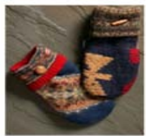
baabaazuzu mittens made from 100% recycled wool www.baabaazuzu.com

Buying recycled-material products saves energy and water, helps to preserve landfill space, supports recycling markets, and bolsters the economy. So not only do you need to recycle your items when you are done with them, but you need to buy the newly made recycled content products to truly support the process. For more information Visit www.recycledproducts.org .