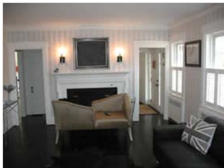
The Map Room blends original wooden molding with contemporary shutters

She decided that her renovations would reflect the look and style of the quintessential Cape Cod Inn she had so admired in magazines. "I had the vision immediately," she says, admitting that knocking down walls and removing bathtubs was a necessary step to reinventing the entire space. She did ensure, however, that original architectural details were not only preserved, but featured in the design to respect the history of the building.